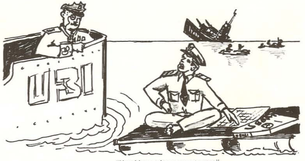
"Now I know where we went wrong"

A. Yes, but it must stop on the first non-road escarpment square it moves to.